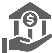
Banking & Financial Laws

Based on experience and with a multi-disciplinary approach, VLA offers a complete range of commercial legal services to the clients across advisory to litigation. We have breadth & depth of expertise, dedication and commitment to provide legal services enabling our client to take crucial business decision. The core areas of practice of the firm are :-