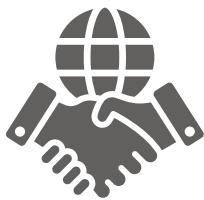
Foreign Trade Laws