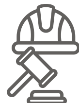
Employment & Labour Laws