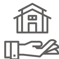
Real Estate Laws