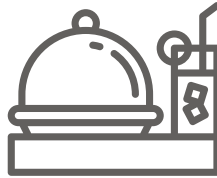
Food & Beverage Laws