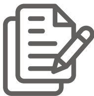
Drafting & Convenyancing